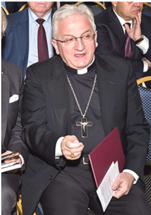
Representing Pope Francis for this celebration of the 500th year anniversary of the Protestant Reformation was the Roman Catholic, Archbishop Celestino Migliore.

Migliore brought out the point which started the entire Protestant Reformation. We wish to ask this man, Who has the final authority in spiritual matters?