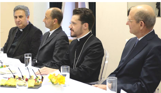
Eating with Catholics and Evangelicals.