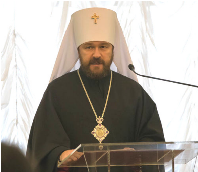
The Orthodox Church was represented by Bishop Hilarion Alfeyev, chairman of the Department of External Church Relations of the Holy Synod of Moscow.