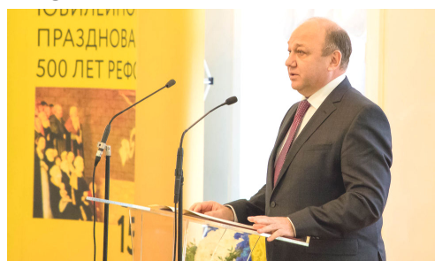
Head of the Moscow Department of National Policy and Interregional Relations, Vitaly Suchkov.