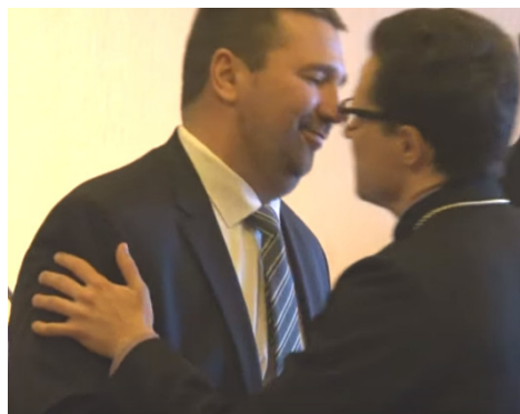
"With her much fair speech" and "flattering of her lips she forced him" Proverbs 7:21.