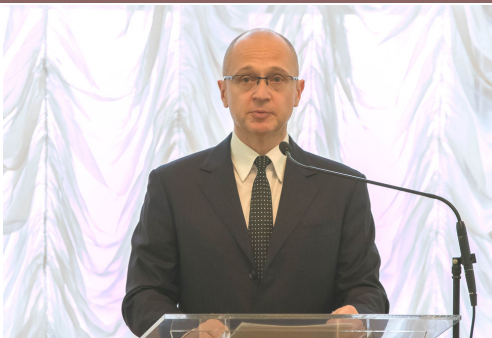
First Deputy Head of the Presidential Administration of the Russian Federation, Sergey Kirienko, President Putin’s right hand man.

In between the speeches by the different speakers a choir made up of Seventh-day Adventists from the different churches around Moscow performed songs from the book of Psalms. For their grand finale, the Adventist choir sang one of the most beautiful pieces of Christian music ever written. They sang George Frideric Handel’s “Hallelujah” Chorus. It was a great song but for the wrong event. They might just as well have