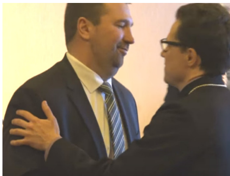
Religious liberty is hard at work.