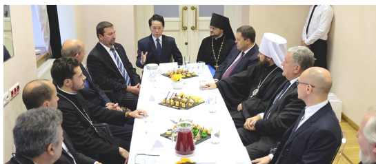
A view of the ecumenical roundtable.